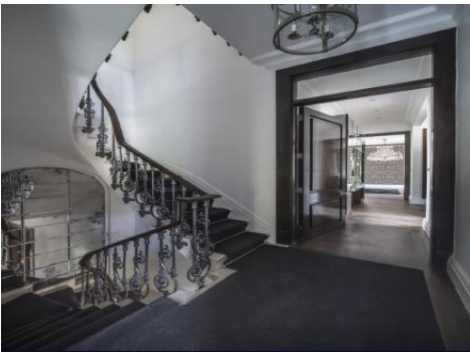
Warwick Avenue, London W9